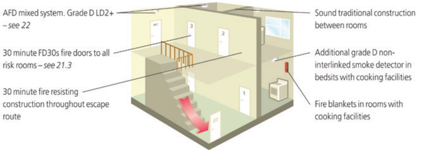
figure D7: bedsit-type HMO, two storeys