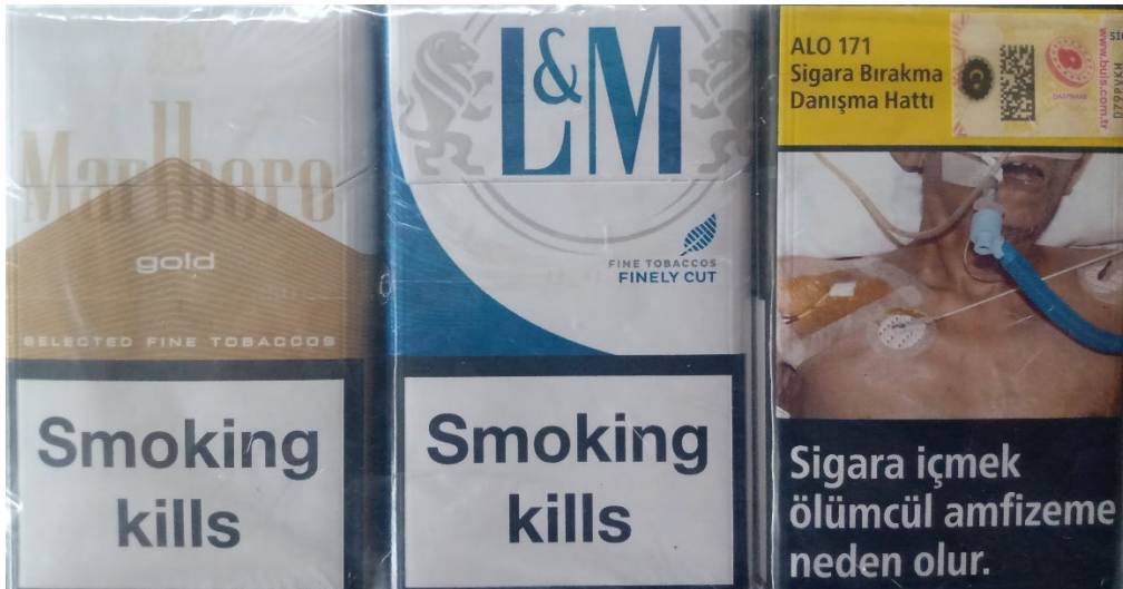
Samples of cigarettes seized: Duty-free Marlboro Gold and L&M Blue; Turkish market Marlboro Touch