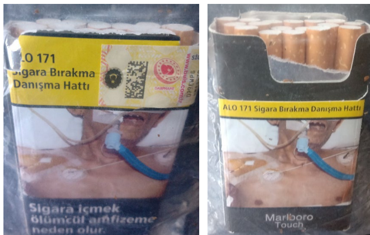
The opened pack, containing 17 cigarettes, with the top torn off. Mr Bhatia confirmed, in the interview, that no staff at the business smoked and suggested that it had been opened accidentally.