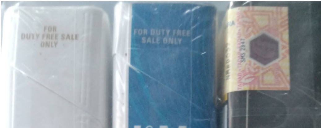
The Marlboro Gold and L&M were marked 'FOR DUTY FREE SALE ONLY'; The Marlboro Touch has a Turkish tax stamp – unlike anything on UK packs – attached.