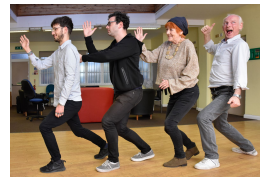
Outside Edge Theatre Company