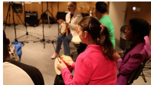
This New Ground