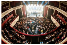
Shepherd's Bush Empire